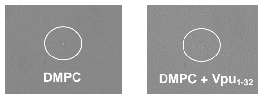
Figure 1. A DMPC vesicle trapped in the focus of an optical Raman tweezer and used for data collection (left) and a vesicle containing Vpu 1-32 (right).

The vesicles were ~1 µm in diameter which is sufficient to be trapped in the Raman tweezers (Figure 1).